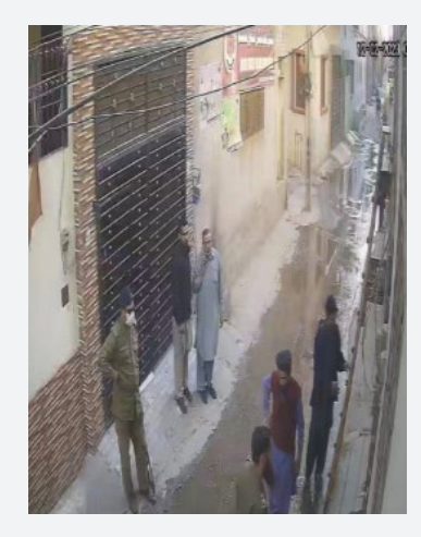
Inscription removed from facade by police