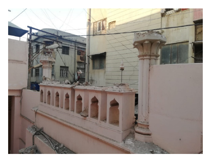
Damaged minarets of Ahmadiyya Hall

The minarets of Ahmadiyya Hall, an Ahmadi Muslim mosque in Karachi, were demolished by members of the public on 2 February. Some chanted anti-Ahmadi Muslim slogans, whilst others climbed the walls and used sledgehammers to destroy the minarets.